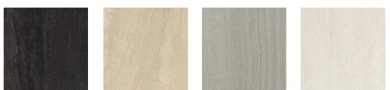
Black Gold Grey White