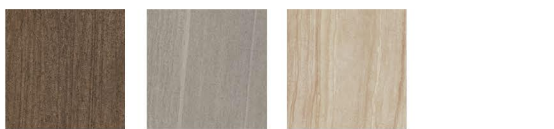
Brown Greige Sand