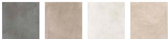
GRAPHITE GRAVEL SALT SAND