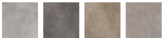
ASH CARBON CLAY FLINT